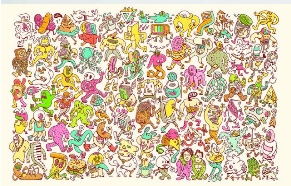
Friends © BROS Mind www.brosmind.com