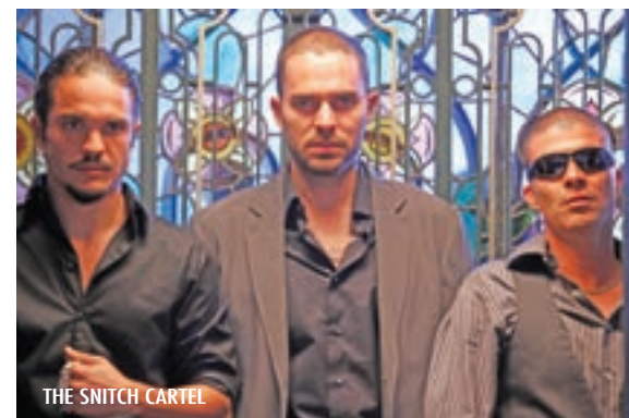
THE SNITCH CARTEL