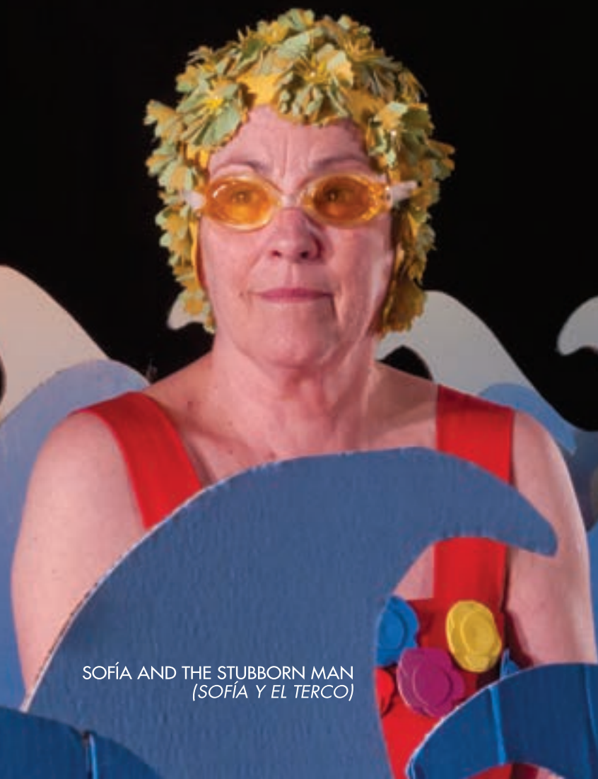
SOFÍA AND THE STUBBORN MAN (SOFÍA Y EL TERCO)