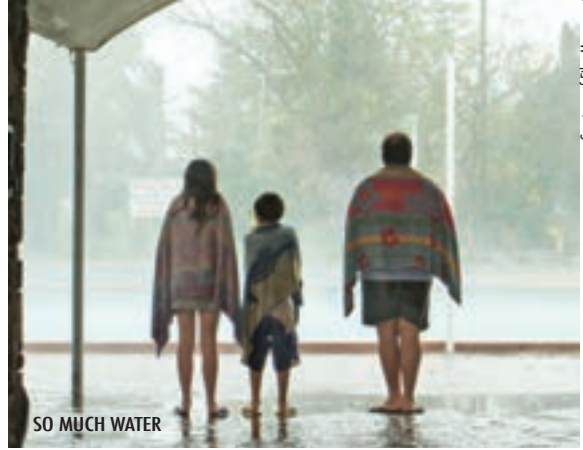
SO MUCH WATER