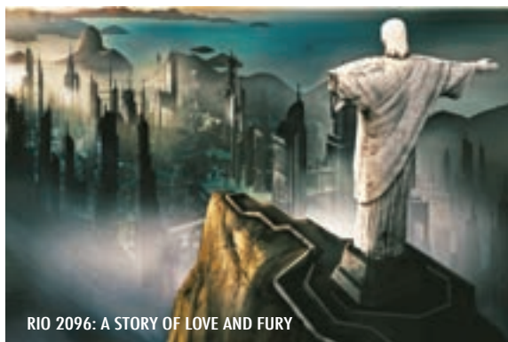
RIO 2096: A STORY OF LOVE AND FURY