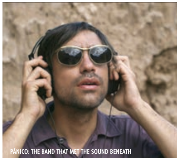
PÁNICO: THE BAND THAT MET THE SOUND BENEATH