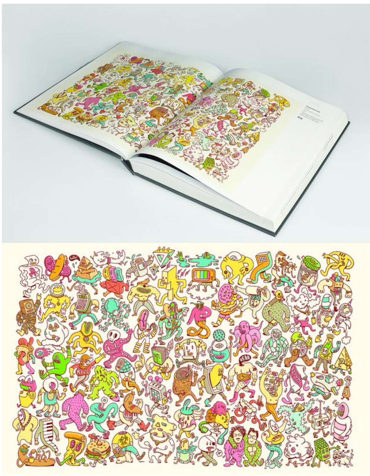
Friends © BROSMIND www.brosmind.com

2375 Pennsylvania Ave, NW Washington, DC 20037 United States